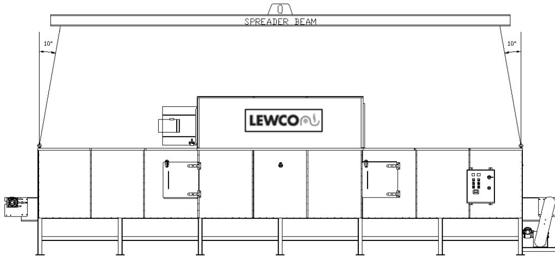
Figure 1: Typical Rigging

Lifting lugs are provided at the top (4) corners of most LEWCO Conveyor Ovens. It is important to note that rigging cables or chains must not exceed a maximum angle of 10 degrees from vertical (see Figure 1 ). Use a spreader beam, or rigging of adequate length to avoid damage to the equipment. Please refer to any assembly drawings for specific assembly and rigging instructions.